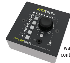
VRE11 Optional wall remote control panel